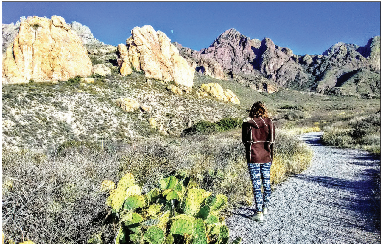
La Cueva Loop Trail is an approximate three mile loop trail features beautiful wild flowers, primarily used for hiking, walking, nature trips and bird watching. The Dripping Springs Natural Area is located east of Las Cruces, on the west side of the Organ Mountains.

and Cultural District, recently received an international award from the Creative Tourism Network. Recognized by destinations worldwide that foster a new generation of tourism, characterized by active participation of tourists in artistic and creative activities. Take part in an active cultural guided Heritage Inspirations tour to the newest U.S. National Parks, the glistening gypsum dunes for a full moon White Sands Retreat, yoga, hike and soak. Venture into a Pioneers of the Past and Fron-